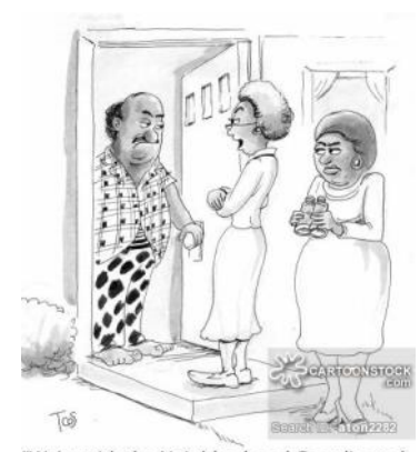
"We're with the Neighborhood Coordinated Clothing Watch."