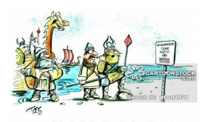
"Uh oh. Ok, back to the boat!"

http://www.fairfaxcounty.gov/complaints/