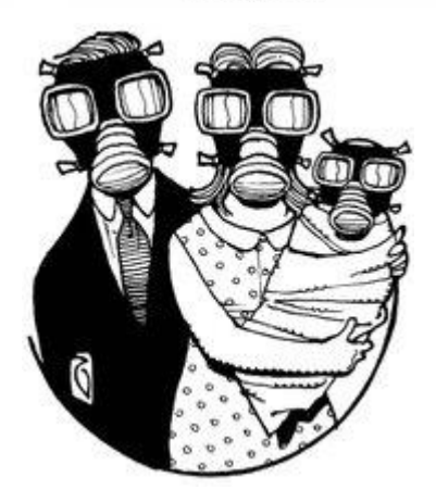
The neighbor's firepit