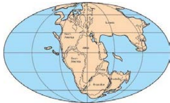
200 million years ago

Flash forward to 300 million years ago. Then Virginia was a land-locked region inside a supercontinent called Pangea Proxima. Our climate would have ranged from Desert to Tropical Summer Wet. Virginia will return to merge with a supercontinent, Pangea Ultima, 200 million years from now; small or no Atlantic Ocean; all Pacific.