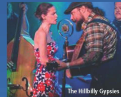
The Hillbilly Gypsies

Braddock Nights is presented in partnership with the supporters of Braddock Nights and generous contributions from the following sponsors: