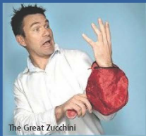
The Great Zucchini