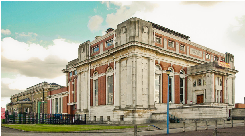
Kempton Park Steam Museum