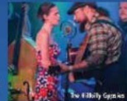
The Hillbilly Gypsies

Wakefield Park in front of the Audrey Moore Rec Center 8100 Braddock Road, Annandale