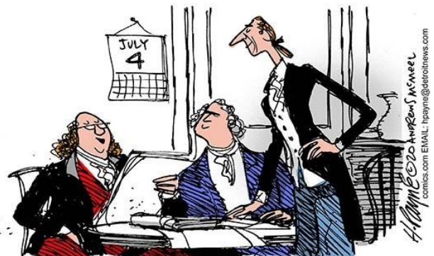
“LIFE, LIBERTY AND THE PURSUIT OF AWESOME BARBECUE! LET'S EDIT THAT TO JUST 'PURSUIT OF HAPPINESS.'”

Board positions are open- It Is YOUR LAKE ACCOTINK PARK help make a difference for about an hour a month! Accepting candidates. Email Contact@flapaccotink.org