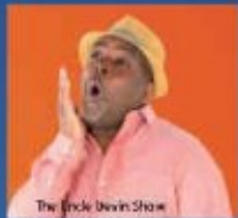
The Uncle Devin Show